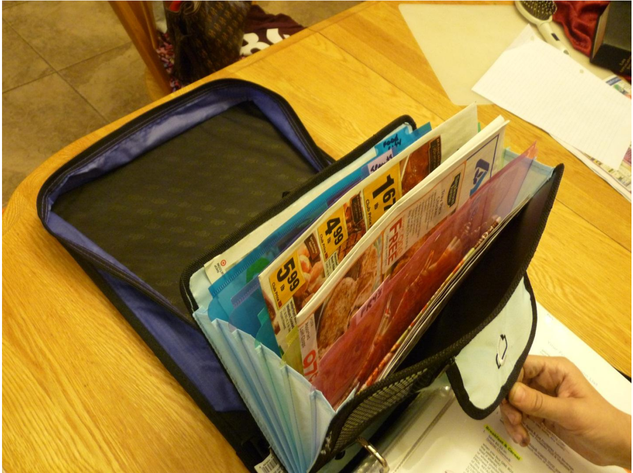
Accordion file to hold my weekly ads and store coupon policies