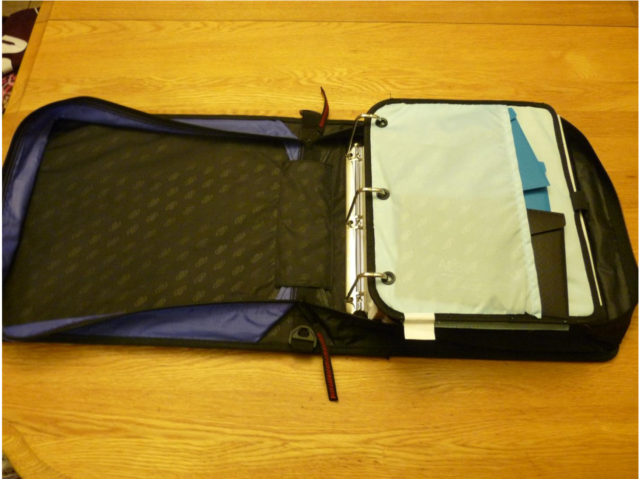
Front pocket to hold my envelopes