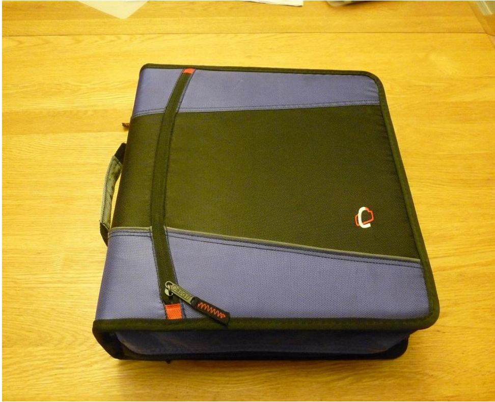
This is my 4 inch binder with a zipper and handle .